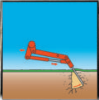
Verti-Drains adjustable parallelogram design shatters the soil, and also allows for clean Coring, on all models.

The 7007 is a concept in deep tine aeration from Redexim Charterhouse. This new Verti-Drain® has the walk in front versatility and maneuverability for the superintendent that only uses pedestrian machines on his greens. The 7007 also incorporates the convenience of ride-on ability to get you quickly to the next green.