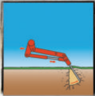
Verti-Drains adjustable parallelogram design shatters the soil, and also allows for clean Coring, on all models.

The slick Verti-Drain Mustang 7110 has a weight of only 725 lbs (330 kilos), and fits to tractors as small as 13HP. Tine depth and tine angles can be set quickly and accurately using a simple handle or lever.