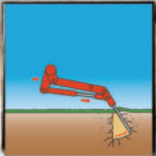
Verti-Drains adjustable parallelogram design shatters the soil, and also allows for clean Coring, on all models.