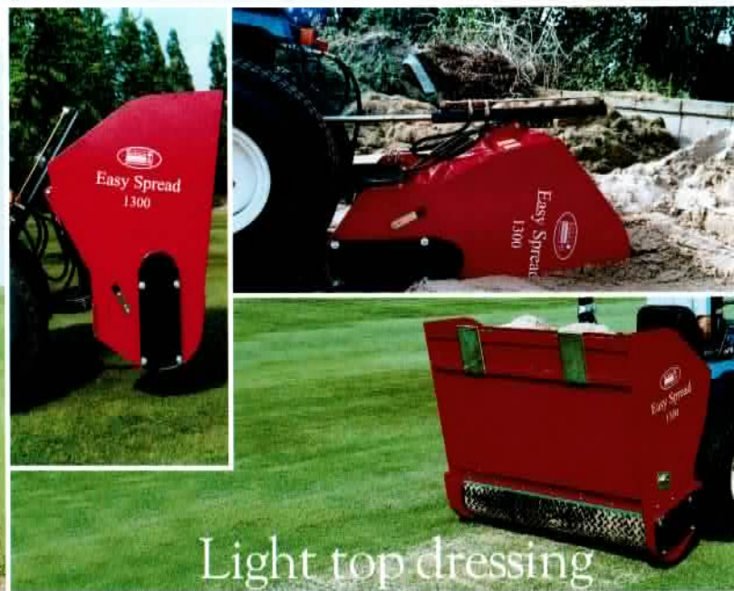
Light top dressing