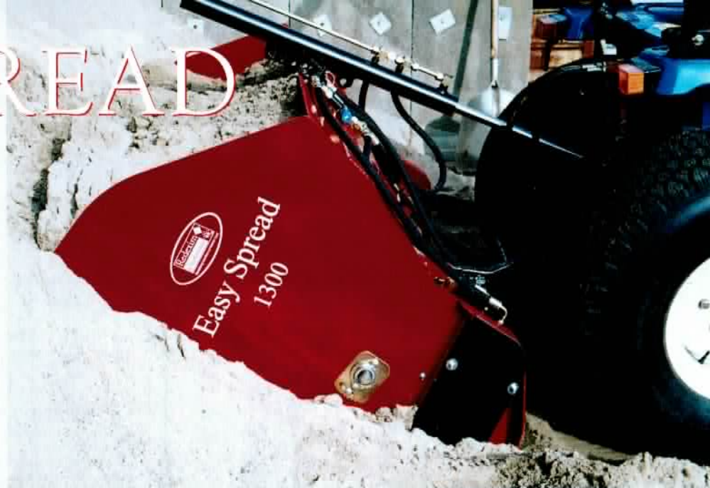
The Easy Spread is very close coupled.

The Easy Spread loads itself. It is easy because it is a simple one man operation that will spread up to 80 tons a day without the operator leaving the tractor seat.