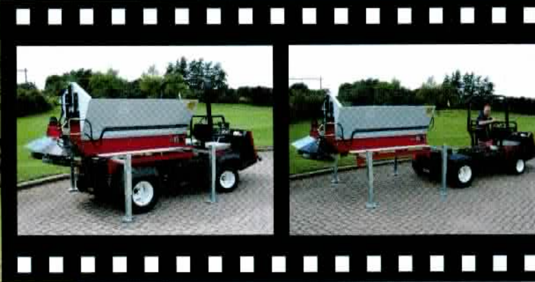
The Jack stand makes it easy to mount and to store the DS 800