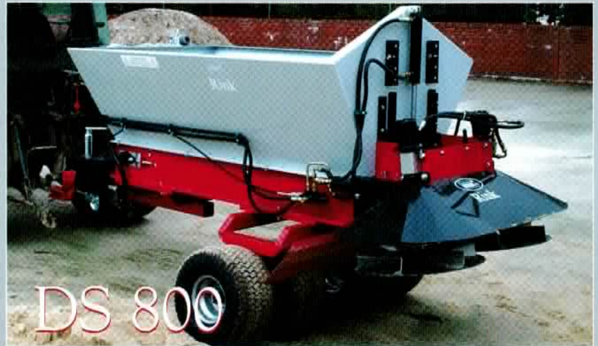
The Rink DS 800 has a smaller hopper capacity

The Rink DS Disc Spreaders are topdressers with dual spinners and a variable spread pattern of up to 12m (DS 3800: 15m) wide. The operation of the belt and spinners can be done from the tractor seat by switching the hydraulic lever. No unnecessary drop of material takes place between stopping and operation, since the material release gate automatically closes when the belt is stopped. The spinner discs have been designed in a way that they will handle wet material very well.