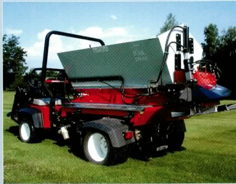
The Rink DS 800 can be carried either on top of the utility vehicle (above) or be pulled (below)