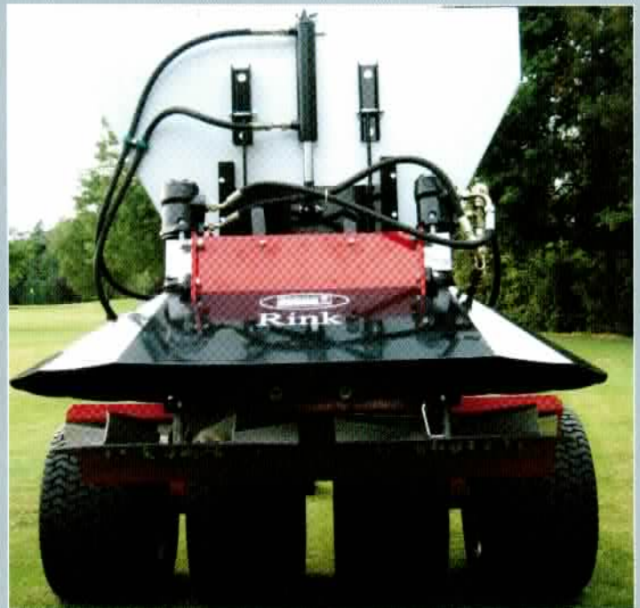
The DS 1200 is standard supplied on large tyres (only pictured here)

The dual spinners can be accurately adjusted for different materials, from very heavy to extremely fine material.