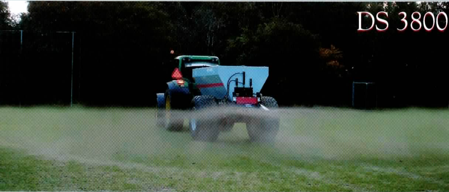
The DS 3800 spreads the material up to 15m (6½ ft) wide